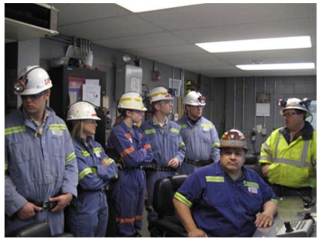
Going underground at Newmont's Leeville Mine