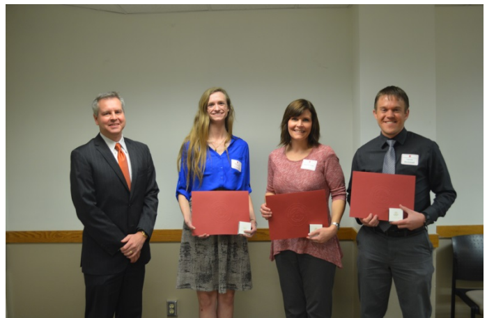
Photo: Students who received Scholarships and Academic Recognition at our Annual Awards Banquet.