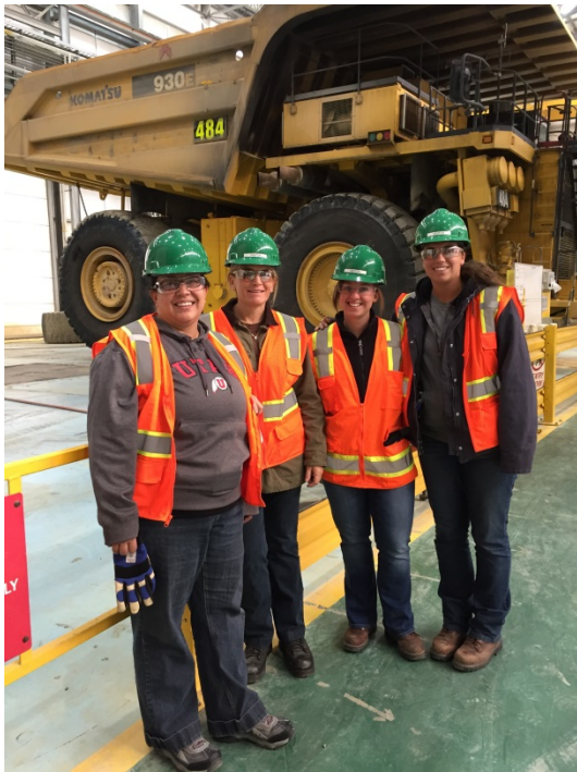
WIM fieldtrip to Rio Tinto Bingham Canyon Mine