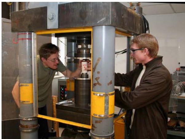
Students prepare a rock sample for testing in the Rock Mechanics Lab.