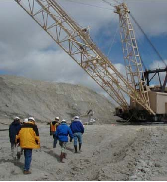
Inspecting the Dragline at the Black Butte Mine, Wyoming