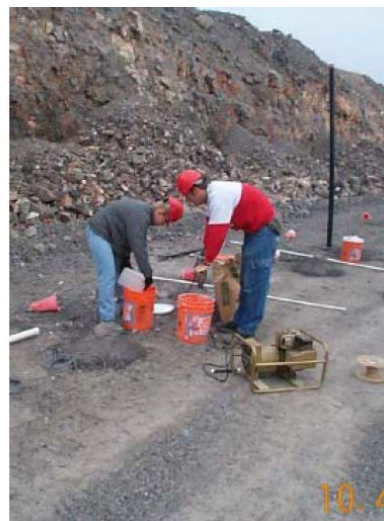
Students Gain Practical Experience in Many Areas, Including Surveying