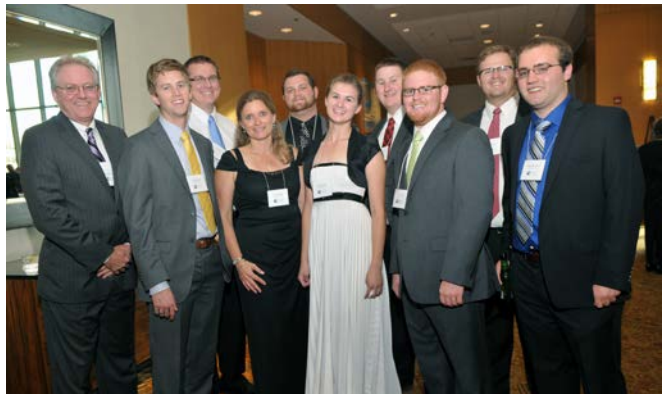
Attending the Mining Hall of Fame Dinner