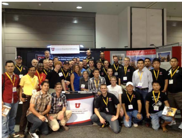
MinEXPO 2012 – Las Vegas, Nevada

Student loans, grants, and need-based and other scholarships are also available through the financial aid office (105 SSB, 581-6211).